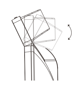
Adjust Camera Angle